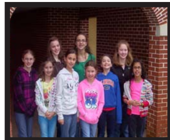
YOUNG MUSICIANS FESTIVAL